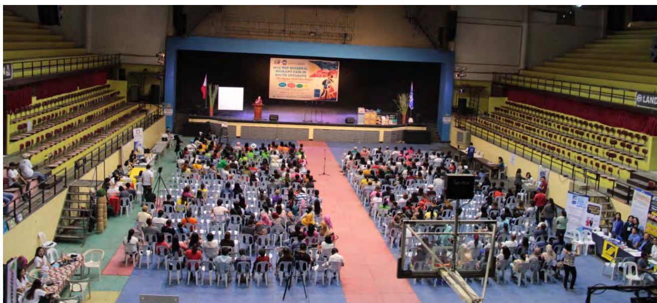
Migrant Fair in South Cotabato