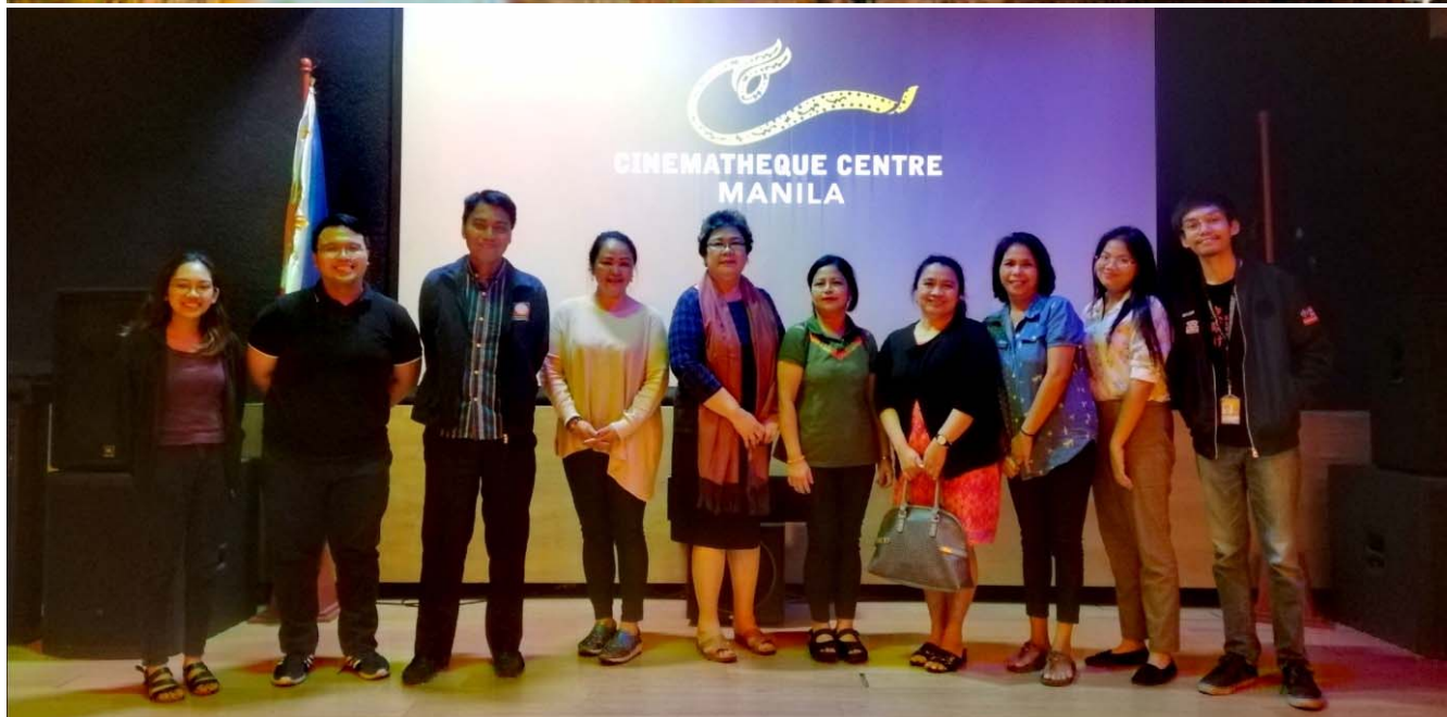
The organizers and participants of the Cine-Forum

The Film Development Council of the Philippines and the IAC-MOF conducted Cineforum on Migration featuring the award winning film “SIGNAL ROCK” at Manila Cinematheque on December 13 2019.