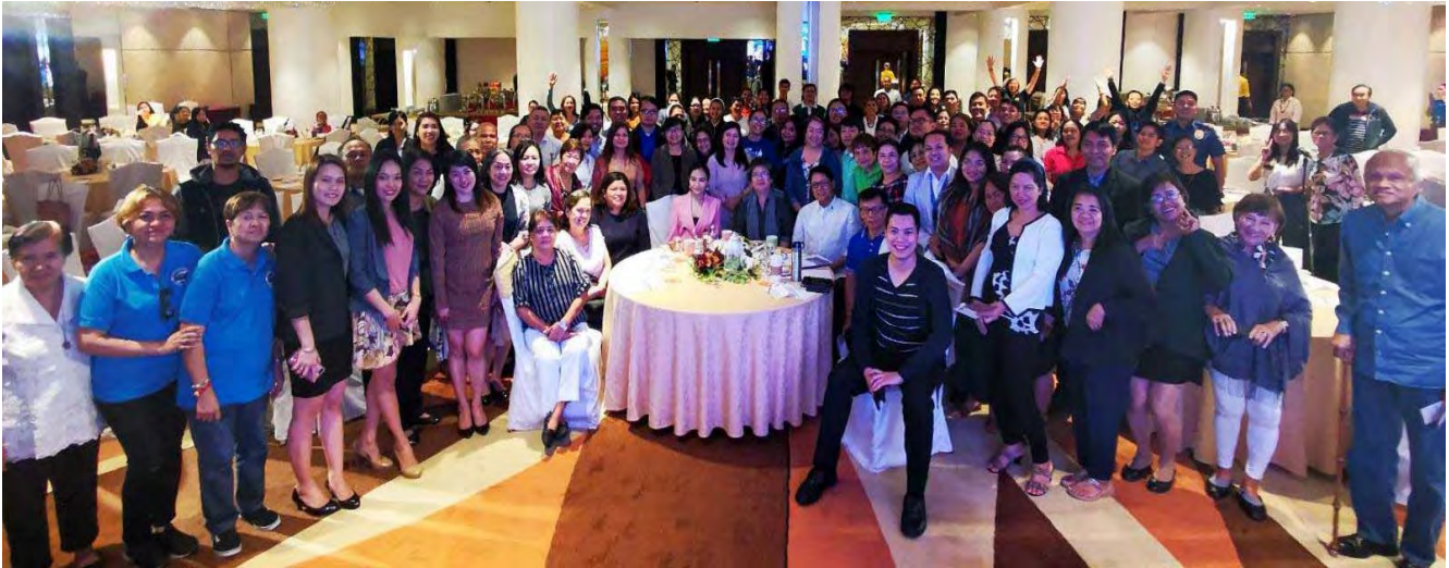
The organizers and participants of the National Forum on Migration

The National Forum on Migration held on December 18, 2019 (which is the International Migrants Day) at Hotel Jen, Pasay City, is the culminating activity of the IAC-MOF. It was sponsored by the Inter-Agency Council Against Trafficking chaired by the Department of Justice.