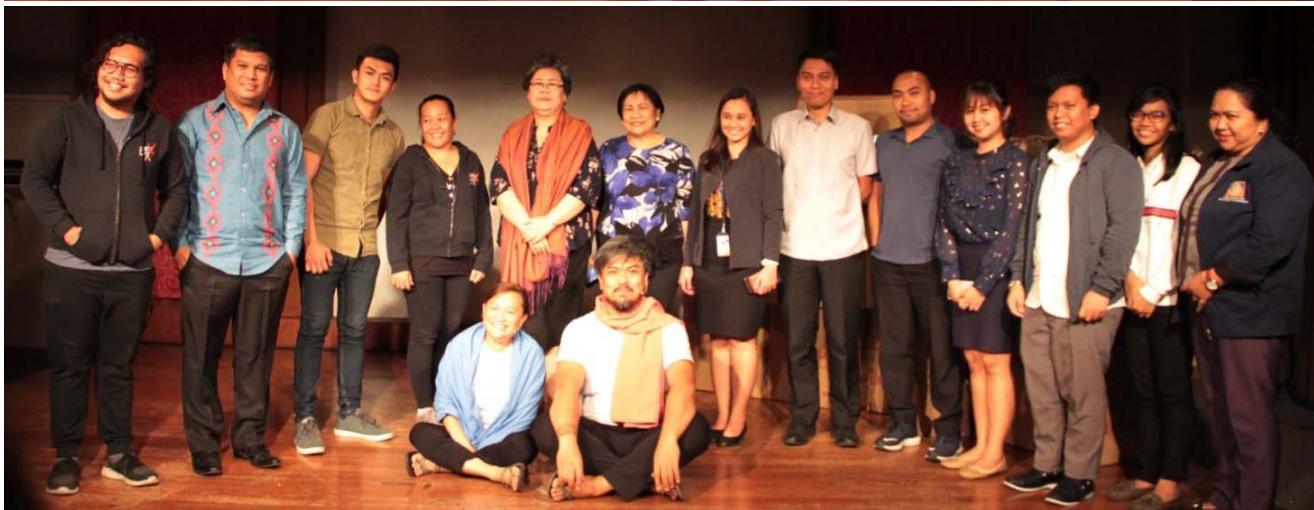
The stage actors and organizers of the Sentro Rizal Lecture Play

The National Commission for Culture and the Arts in partnership with the Philippine Educational Theater Association, conducted the “Balik-Kuwento ng Bayan: A Sentro Rizal Lecture-Performance on Philippine History” at the NCCA Auditorium on 25 November 2019. The interactive lecture performance mainly targets overseas Filipino youth and students, for them to have deep appreciation of their home country, Philippine culture and history. It traces the colourful and poignant historical events of the Philippines starting with the myth of Malakas and Maganda, to Spanish, Japanese, and American colonization and Martial Law.