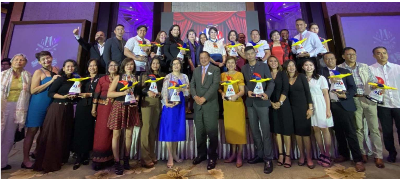
The winners of the 2019 MAM Awards

The Commission on Filipinos Overseas led the conferment of Migration Advocacy and Media Awards to 20 best media works from the Philippines and abroad during the Awarding Ceremony on December 17, 2019 at the Diamond Hotel, Manila.