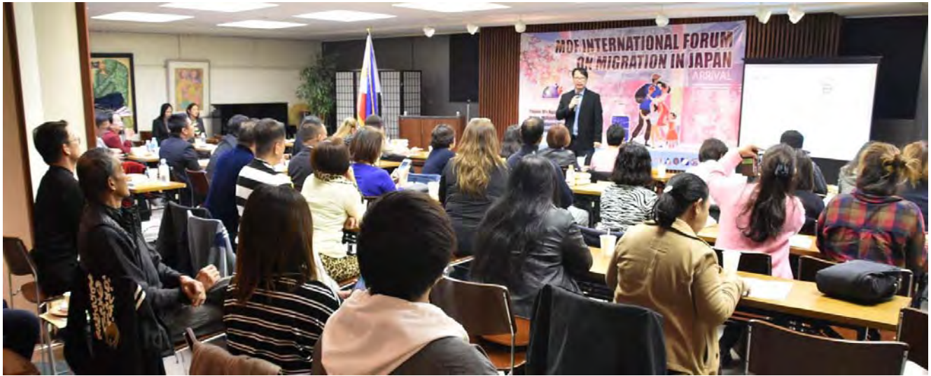
International Forum on Migration

The International Forum on Migration, held in Tokyo, Japan on November 17, 2019, is the only activity organized overseas by the IAC-MOF in partnership with the Philippine Embassy-Tokyo and Philippine Overseas Labor Office-Tokyo. Home to more than 300,000 Filipinos, Japan is a major destination of OFWs in Asia, majority of them are permanent or long term residents, spouses and children of Japanese.