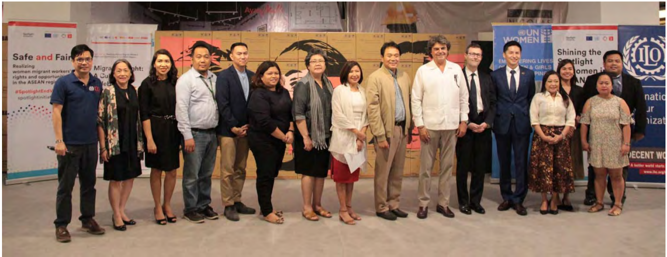
The organizers of the Babaeng Biyahero Cultural Night

United Nations Women-Philippines and International Labour Organization-Philippines conducted the Migrants' Night: A Cultural Celebration with Biya(heroes) at Ayala Malls Manila Bay on December 18, 2019. A night of music and performance, this is the culminating activity of the "Babaeng Biya(hero): Travels, Travails and Triumphs of Filipina OFWs" campaign launched on November 24, 2019. The exhibition features Filipina migrant workers' biyaha (journey) through their experiences and hardships working and living abroad.