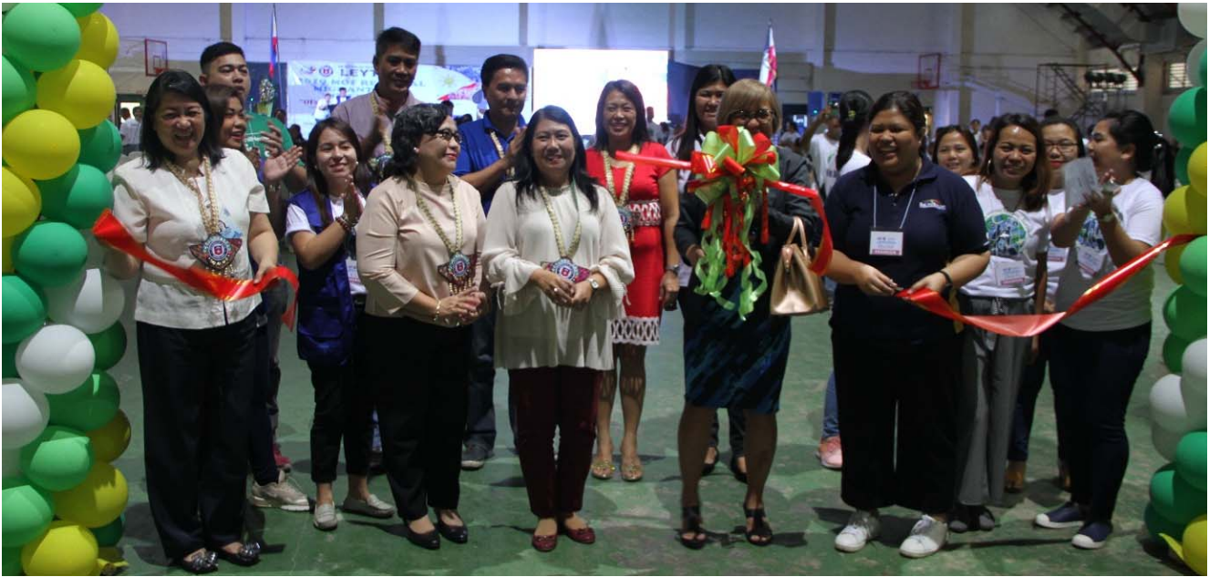
Migrant Fair in Leyte

The kick-off activities of the IAC-MOF are the Regional Migrant Fairs held in Koronadal, South Cotabato (October 16, 2019), Sorsogon City, Sorsogon (October 25, 2019) and Palo, Leyte (November 11, 2019). The areas (coming from Luzon, Visayas and Mindanao) have been identified to have large concentration of OFW families.