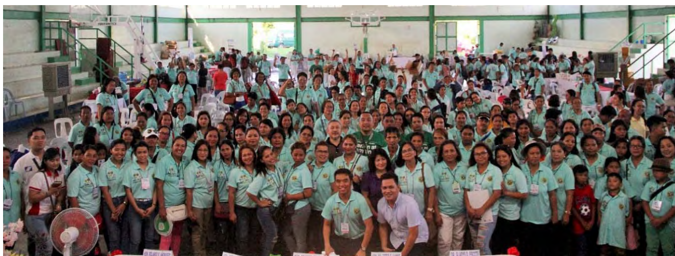
Migrant Fair in Sorsogon