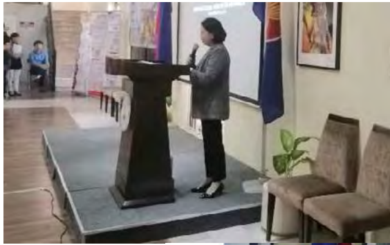
Photos during the International Forum on Migration in Dubai