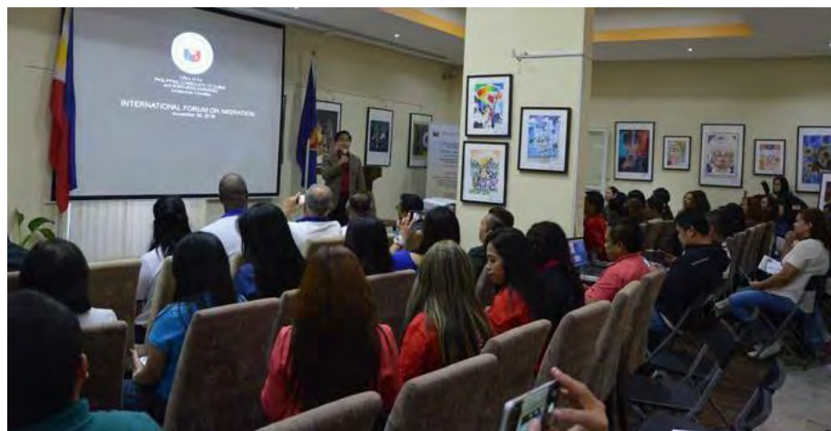
Consul General Paul Raymund Cortes welcoming the OFW participants during the Forum

Free financial awareness seminar was given to more than 120 OFWs at the Philippine Consulate General in Dubai, United Arab Emirates on November 30, 2018. Home to more than 600,000 Filipinos, UAE is a major destination of OFWs with the majority of the Filipino