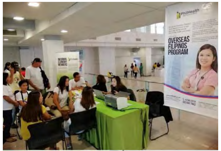
During the free consultation with migration-related agencies for migrants and their families

The event started with free consultation with migration-related agencies for migrants and their families. Officers and representatives from the CFO, Department of Foreign Affairs, Department of Labor and Employment, National Reintegration Center for OFWs, Overseas Workers Welfare and Administration, Department of Trade and Industry, Department of Health, Department of Social Welfare and Development, Philippine Statistics Authority, and Technical Education and Skills Development Authority, provided assistance and information materials, and entertained inquiries (on ATN cases, scholarship program for dependents of OFWs, passporing, human trafficking, setting up of business, etc.) from the participants. The PhilHealth, Social Security System and Pag-IBIG offered first time membership application and registration services, and updates on contributions for their respective members.