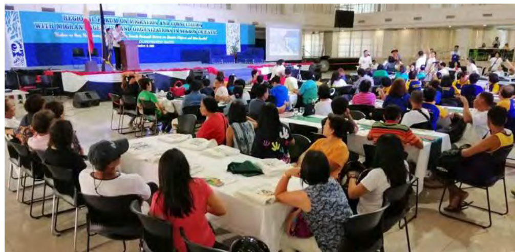
Participants to the Regional Forum are migrant organizations and families from various municipalities of Negros Oriental and Occidental.

The second leg of the Regional Forum was held at Negros Oriental Convention Center in Dumaguete, Negros Oriental on November 9, 2018. The event was organized in partnership with the Provincial Government of Negros Oriental under the leadership of Governor Roel Ragay Degamo; and was attended by more than 200 participants composed of migrants, migrant returnees and their families,