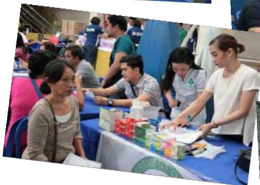
During the health fair and hataw exercise