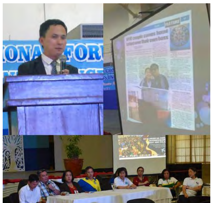
Photos taken during the Regional Forum on Migration