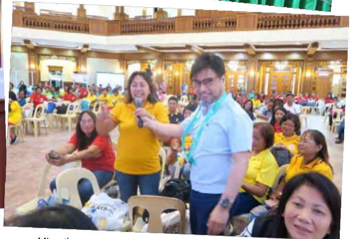
Photos during the Regional Forum on Migration