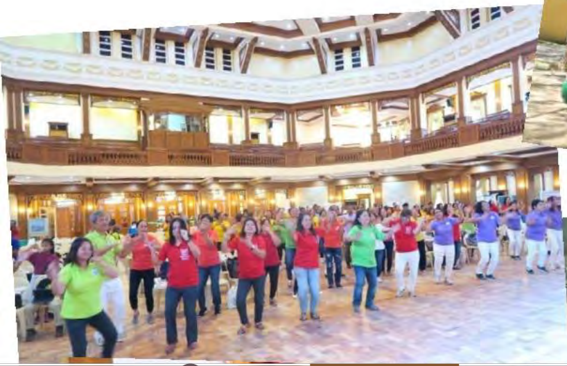
Photos during the Migrants Health Fair and provision of various services by the IAC-MOF members

and Industry) Commission on Filipinos Overseas) and International Organization for Migration through their respective members' verification and contribution updating and information booths. The participants were also entertained by Danggoan Pangasinan) a cultural dance group.