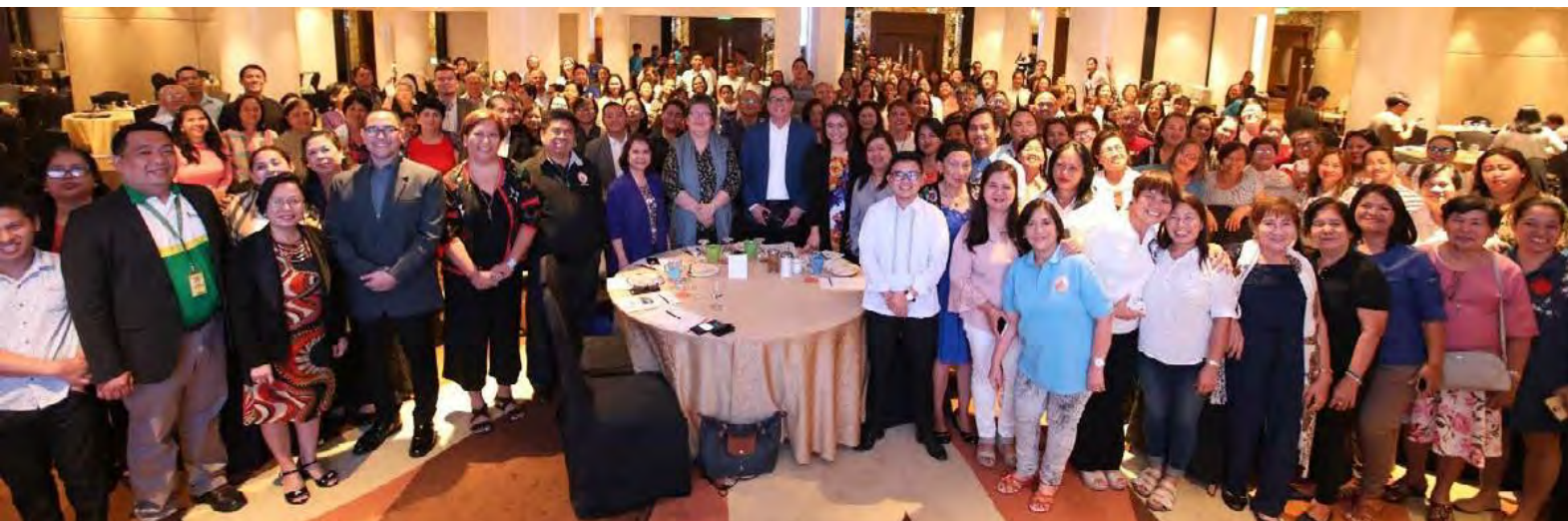
The guests and participants of the National Forum on Migration

The National Forum on Migration which was held at Hotel Jen in Pasay City on December 18, 2018 – the International Migrants Day, served as the culminating activity in the series of fora for this year. It was attended by 250 participants that include overseas Filipinos, OFW families, academe, representatives from the government and other stakeholders in the migration process. It was supported by the Inter-Agency Council Against Trafficking (IACAT) chaired by the Department of Justice.