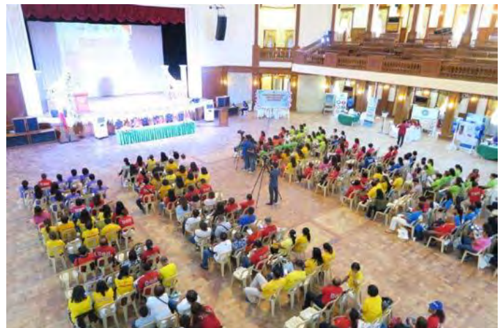
OFW families and associations from different municipalites in Pangasinan participated in the Regional Forum.