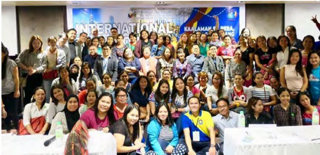
The IAC-MOF members and participants to the forum

An open forum was also conducted before the end of the program, for participants to clarify and have better understanding of all the programs and services presented to them in the day. A critical discussion of disinformation and clarification mostly took the slot for the